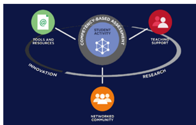
Figure 1: UOC's educational model